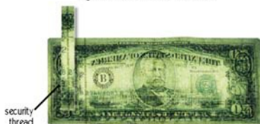
Figure D - Series 1990 through 1995