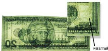
Figure C - Series 1996 and later