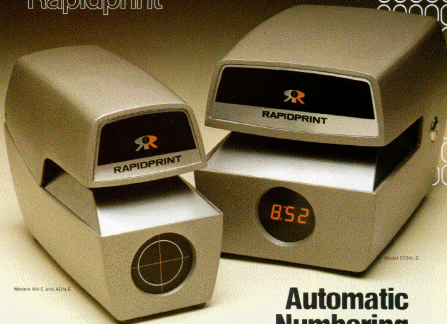
Models AN-E and ADN-E

000001 000002 000003 000004 000005 000006 000007 000008 000009