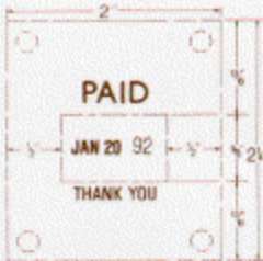
Sample impression (reduced):