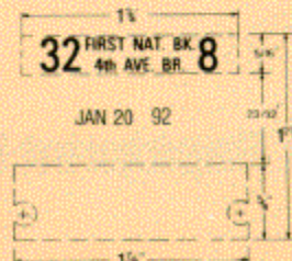
Sample impression (reduced):