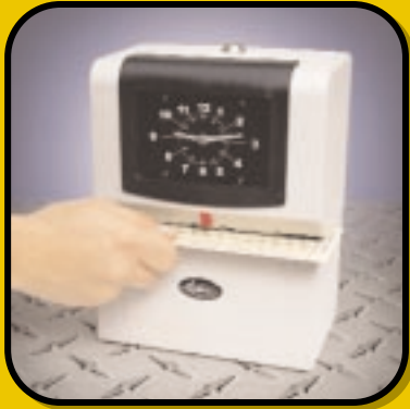
4200 Series (Cool Gray)

Need a steel tough time clock without a tough price? Lathem's mechanical time recorders can't be beat. Ideal for payroll time or job costing, these heavy duty time clocks can withstand high volume use and harsh environments. Whether you choose automatic (4000 Series) or manual (2000 Series) activation, the indestructible coined steel type wheels offer smooth reliable operation and a crisp clear registration every time. Mounted securely to a wall or on a tabletop, the steel case and key lock provide a durable and tamper-proof installation. The two-color ribbon self-reverses at the end of the spool for longer life, and can easily be changed. Works with almost any standard time card.