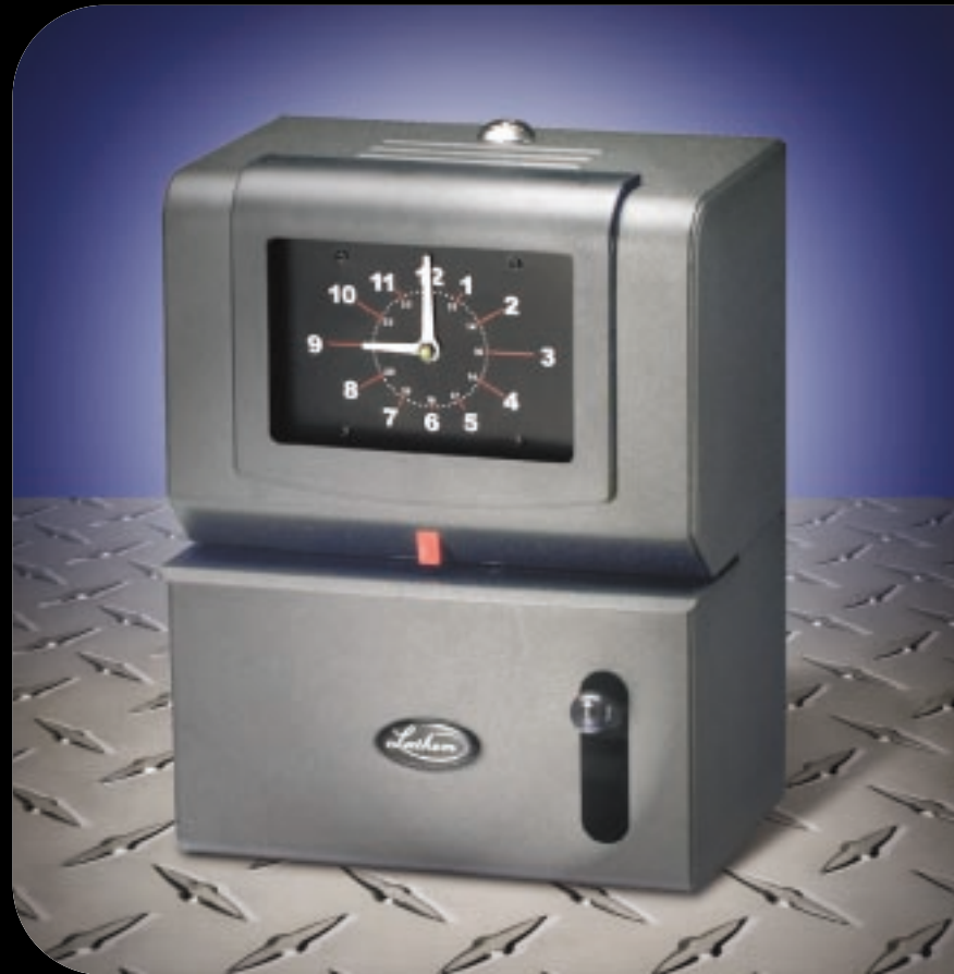
2100 Series (Charcoal Gray)