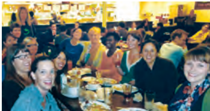
Supporters enjoy good food and great company on Gerson Community Day at Native Foods.