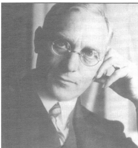
Max Gerson, M.D. (1881-1959)